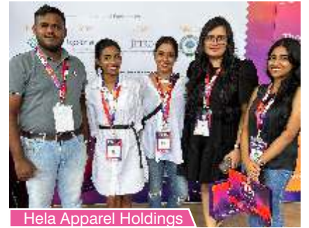
Hela Apparel Holdings